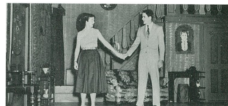
I'll take the shortcut across the graveyard and hurry back.