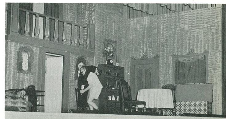
There'll be another body in the cellar