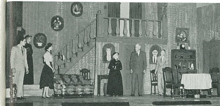
Funeral services in the cellar?