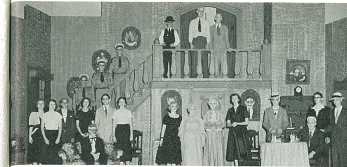
The entire cast