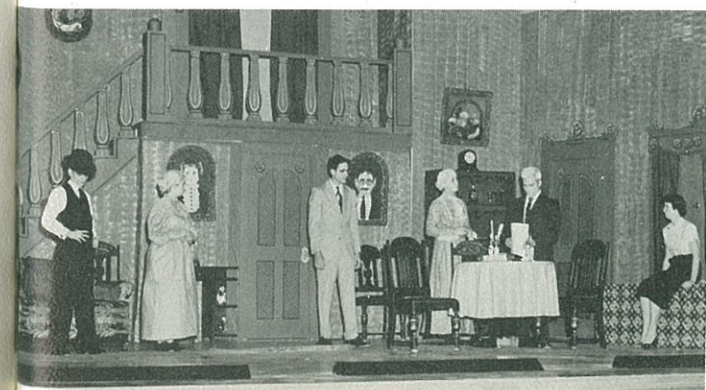
Papers for Happy Dale