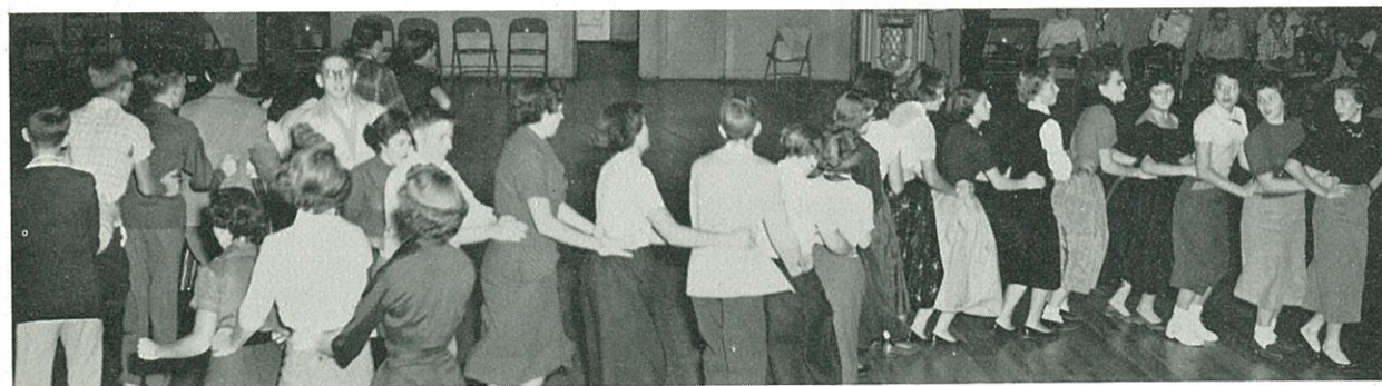
Everyone is doing the Bunny Hop.